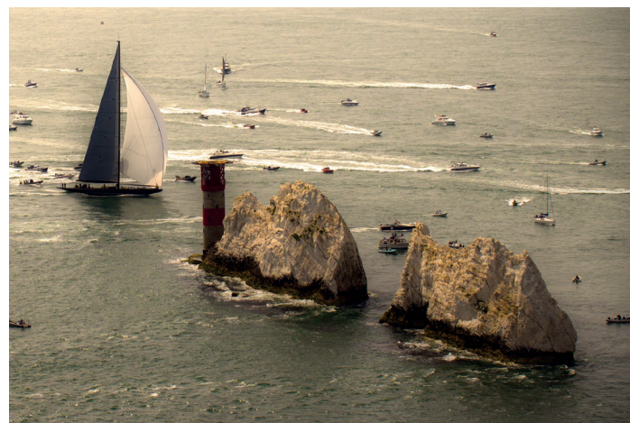
PREVIOUS PAGE Founded in 1815, the Royal Yacht Squadron in Cowes is one of the most prestigious and exclusive yacht clubs in the world; ABOVE LEFT One of the most iconic views of the Isle of Wight - The Needles; ABOVE RIGHT The hotly contested Round the Island Race.

If you're seeking a change of pace and a slice of idyllic island life, then the Isle of Wight is the perfect destination, offering a myriad of reasons to entice individuals and families to make it their home. From stunning natural landscapes and a strong sense of community to a thriving arts scene and a more relaxed lifestyle, it's the ideal choice for those considering a change of pace.