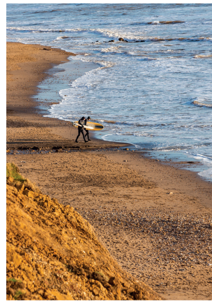
ABOVE CLOCKWISE FROM LEFT TThe Isle of Wight Festival attracts many thousands of people; Ventnor Botanic Garden has its own microclimate and grows species from around the globe; Surfing at Compton Bay.

esplanade at Ryde and on to Sandown and Shanklin or jump on a Southern Vectis bus from any ferry port to the county town of Newport and beyond. The nearest airport is Southampton.